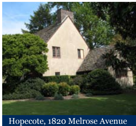
Hopecote, 1820 Melrose Avenue

on the National Register of Historic Places, including Tyson Hall and Hopecote on Melrose Avenue; The Hill and many of its buildings; Cowan Cottage, located in Fort Sanders; and River Road and Morgan Circle on the UT Institute of Agriculture Campus. Currently, UT-Knoxville has no structures named on the National Register.