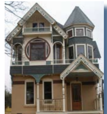
1618 Washington Avenue

This year also brought a new event, Weekend in the Attic, an auction and appraisal event