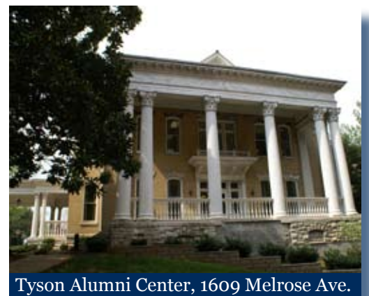
Tyson Alumni Center, 1609 Melrose Ave.